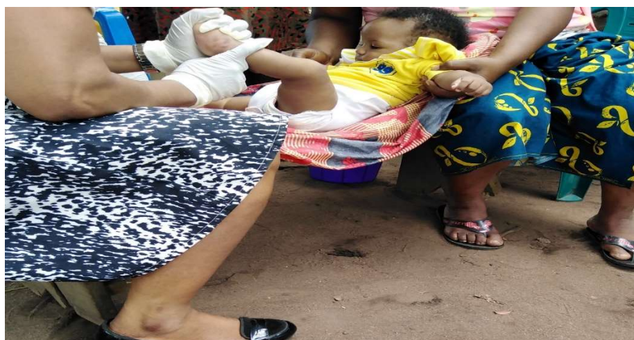
Figure 3 The Physiotherapist examined a child with disability.