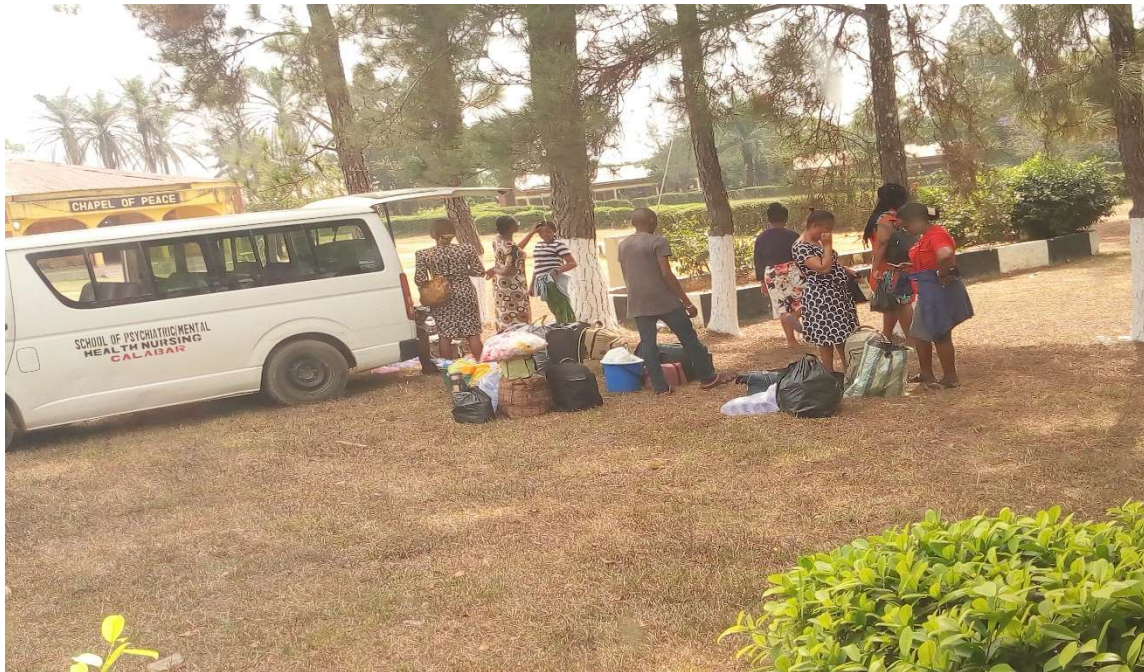
Figure 4. Student Nurses from Federal School of psychiatric Nursing Calabar at Amaudo for training

5. TRAINING ON “COMMUNITY MENTAL HEALTH CARE SKILLS” FOR STUDENT NURSES: In February 2020, Amaudo hosted 30 student nurses from the Federal School of Psychiatric Nursing Calabar who were trained on skills in community mental health care. No school has visited again because of the COVID 19.