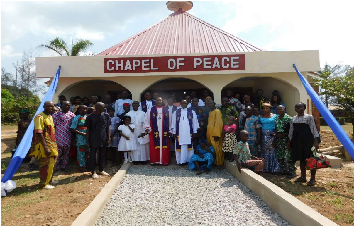
Figure 5. Rt Rev O C Chiemeka with Amaudo Community after dedicating the reconstructed chapel of peace.

8. AGRICULTURE: Farming has become an important investment in Amaudo. In 2020 we engaged in extensive farming of cassava, melon, and vegetable. The crops are very strategic to the reduction of cost of the feeding of residents at Amaudo 1 and 2. The palm plantation has been the source of palm oil used at Amaudo 1 and 2. Over 5 years now Amaudo has produced the palm oil and garri that we use at Amaudo 1 and 2. We have improved in vegetable and melon. Other aspects of farming include goat keeping, cocoa and plantain. The investment in agriculture has helped to reduce the cost of feeding the residents. This is important for the sustainability of Amaudo services.