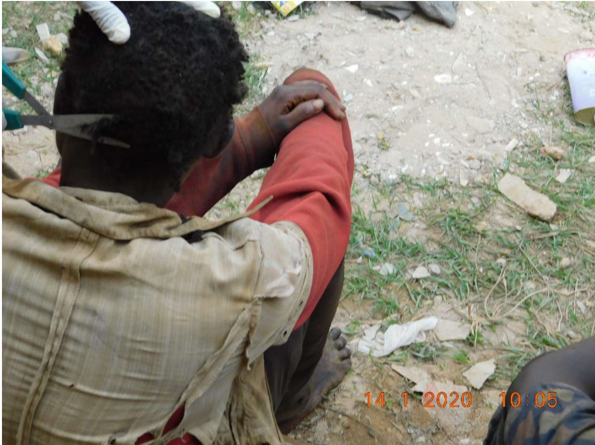
Figure 1 Rehabilitation begins with cleaning up