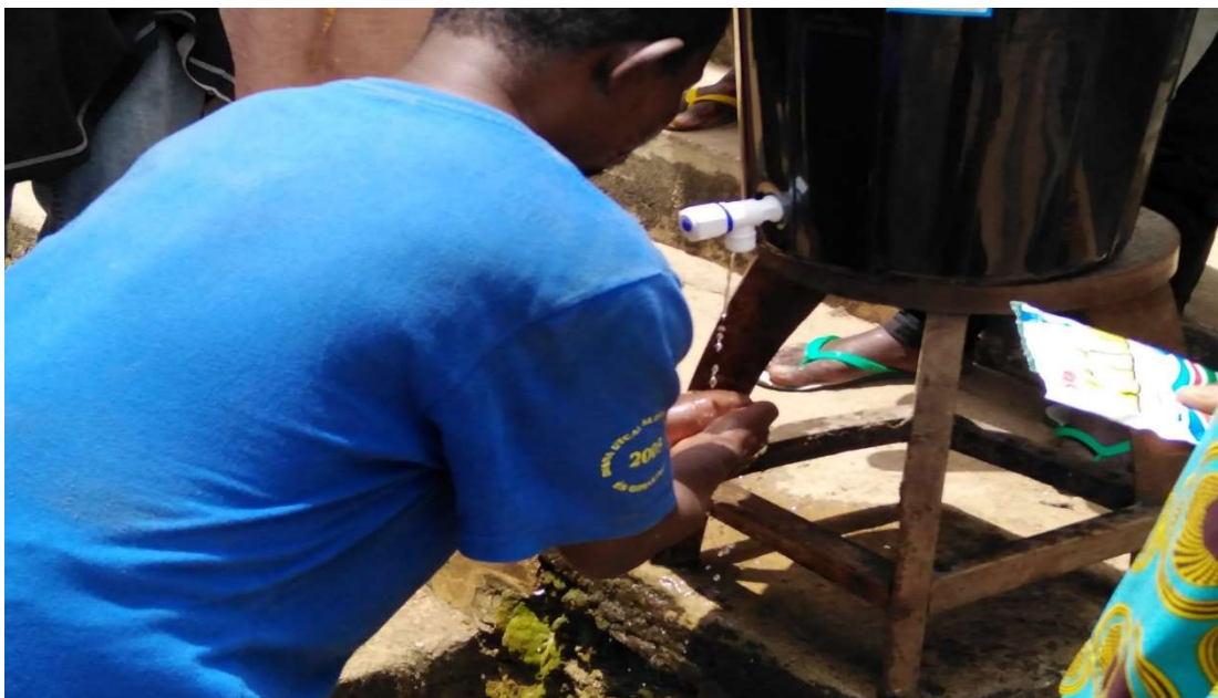
Figure 7. A Resident wash their hands before going into the dining to eat as personal hygiene to check the spread of COVID 19

Amaudo did not use the palliatives for the residents at the centre only, we extended the distribution of the palliatives to children with disabilities in communities like Ohafia, Bende and Isuikwuato. The indigent people among our host communities also received palliatives like rice and face mask from Amaudo. Amaudo also distributed some palliative like indomie and rice to people with mental health problems in Ikwuano, Umuahia North and Umuahia South. We are grateful to God for protecting us during the COVID 19 in 2020 because none of our staff or residents contacted the COVID 19 and we were able to contend with the challenges.