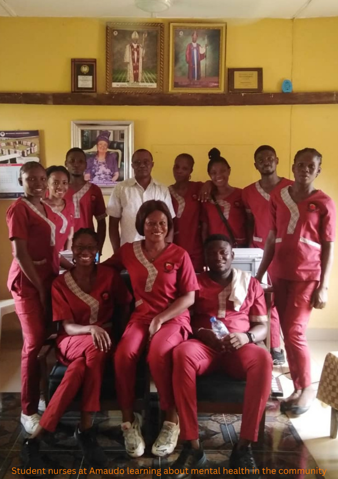
Student nurses at Amaudo learning about mental health in the community